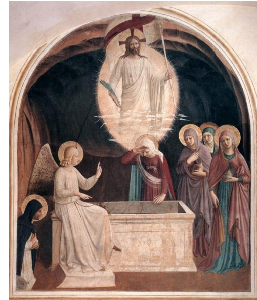
Fra Angelico: Resurrection and Women at the Tomb

Easter Sunday, April 1: The Act of Consecration of Man at Sunrise, 7:00: The house of Earth Sunday Service for Children at 10:20; The Act of Consecration of Man at 11:00: The Gardener