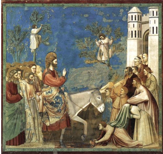
Giotto: Christ Enters Jerusalem