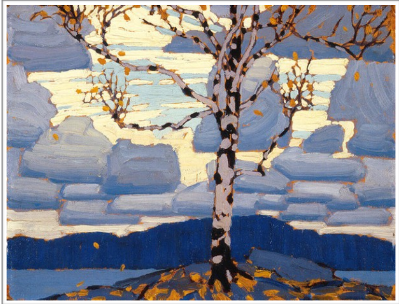
Landscape study by Tom Thomson, Ontario, Canada