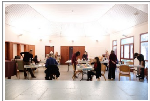
Art teacher Regine Kurek guides all the students through a discovery of the interplay of light and color.