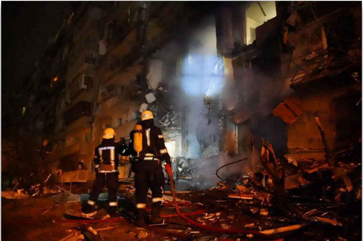
Firefighting at night in Kyiv on 25th February