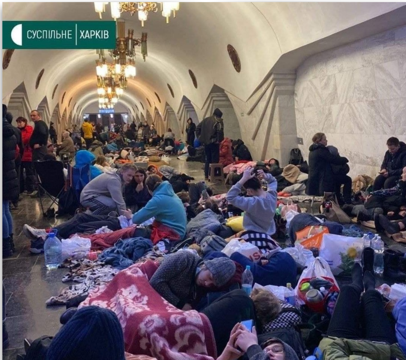
Kharkiv metro station 24-25th of February

Donations to support refugees and humanitarian aid in connection with the war can please be transferred to the account of the West German Region of the Christian Community with a corresponding reference in the purpose of use: