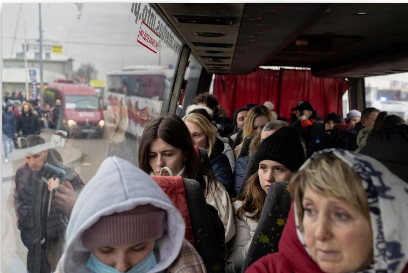
Refugees on the Polish border 26th of February