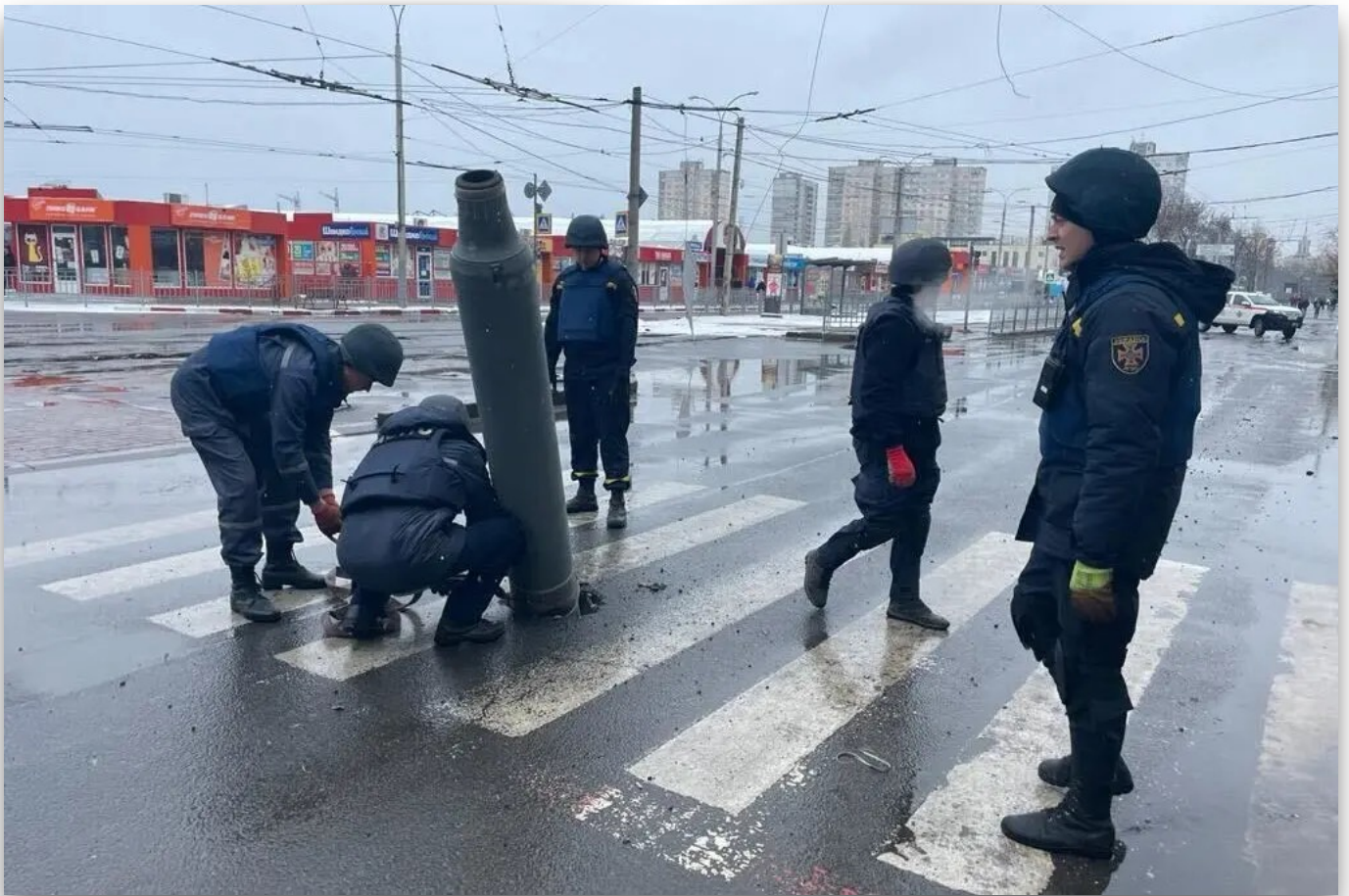
Cleaning up undetonated Rockets in Kharkiv 26th February