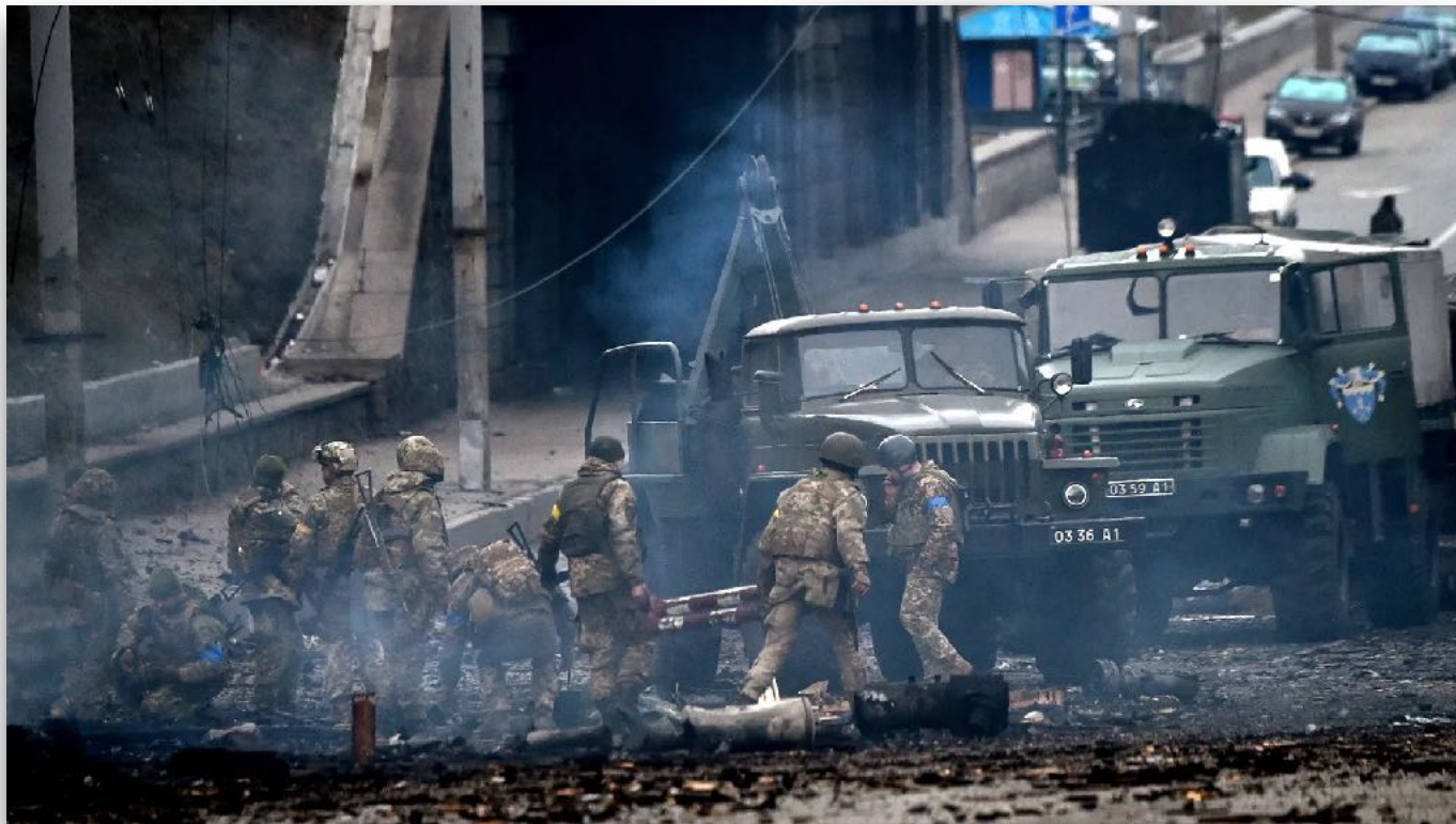
Cleaning up undetonated Rockets in Kyiv 26th February