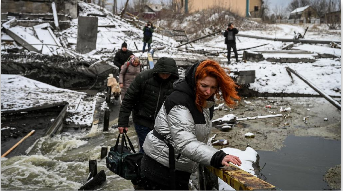
Bucha near Kyiv