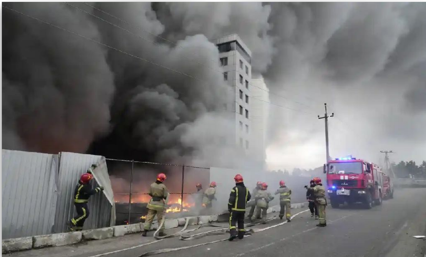
Bucha near Kyiv