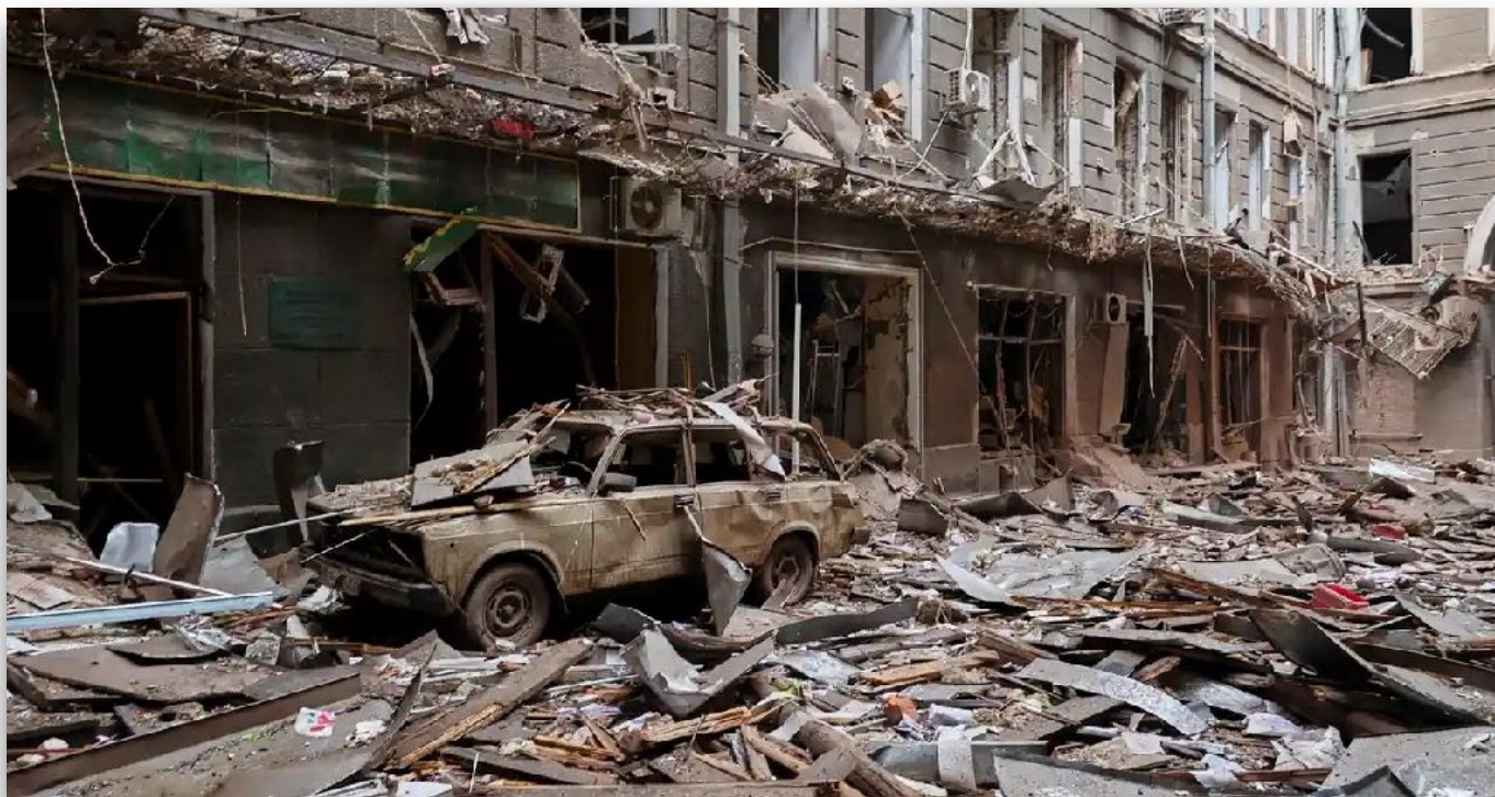
Destruction in Kharkiv