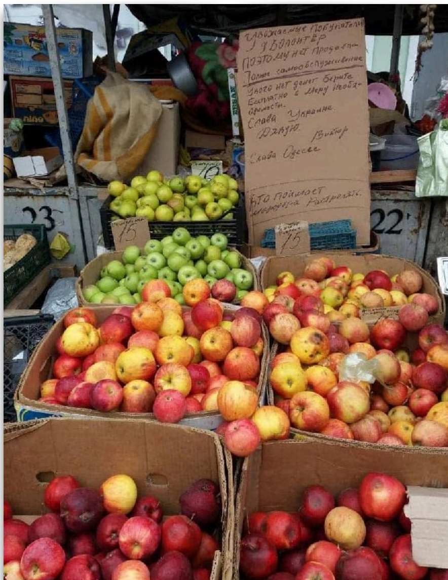
Odessa, central market. On the cardboard: "Those who cannot pay are welcome to help themselves".

Donations to support refugees and humanitarian aid in connection with the war can please be transferred to the account of the West German Region of the Christian Community with a corresponding reference in the purpose of use: