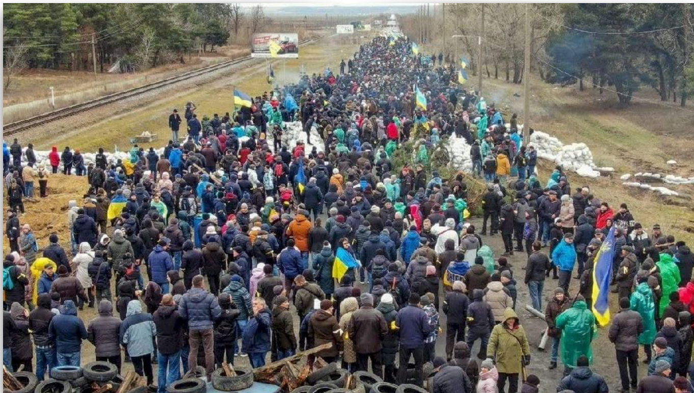
Unarmed citizens block Russian troops' access to nuclear power plant in Enerhodar, Zaporizhia