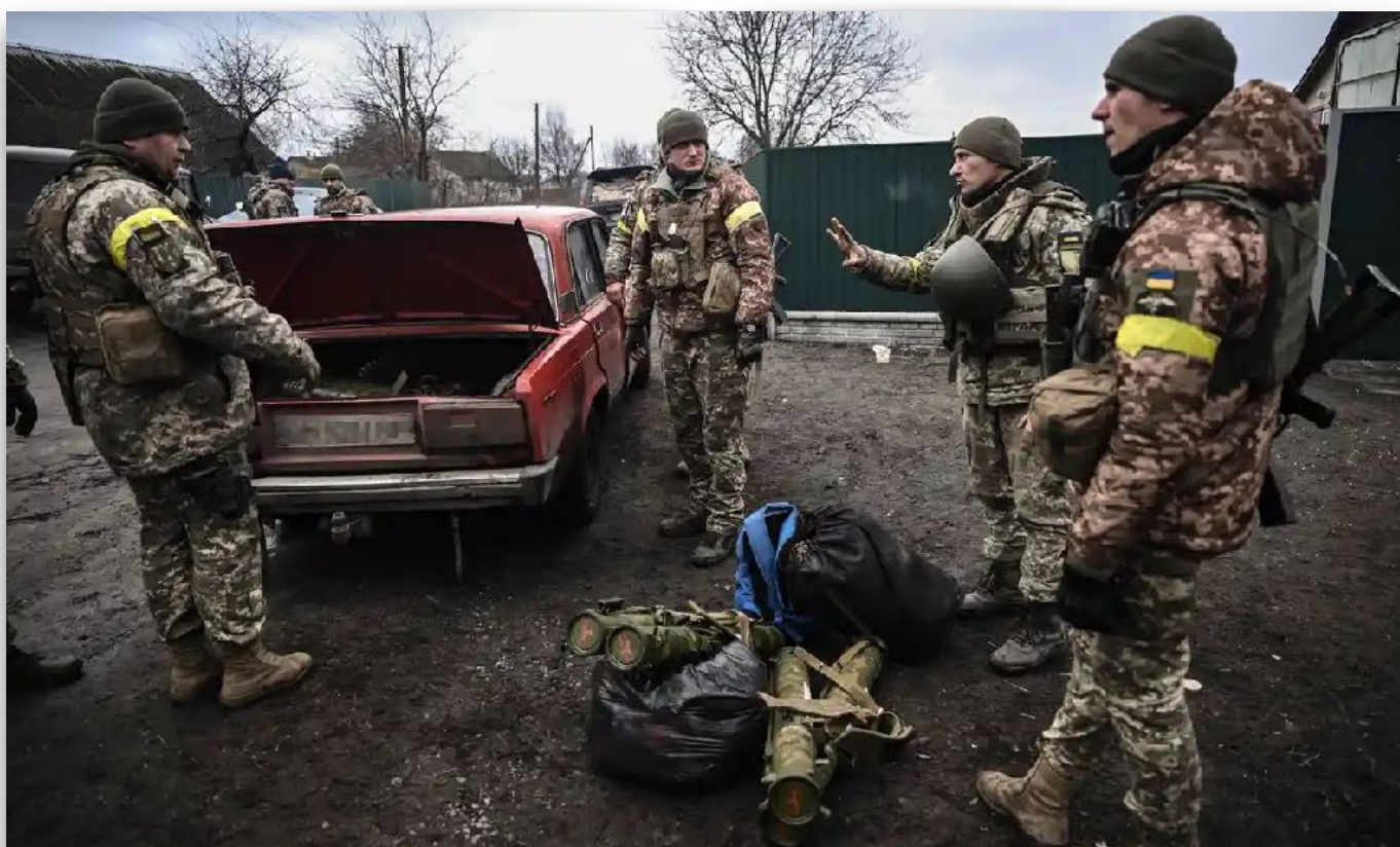
Yesterday, poets and actors - Today, soldiers