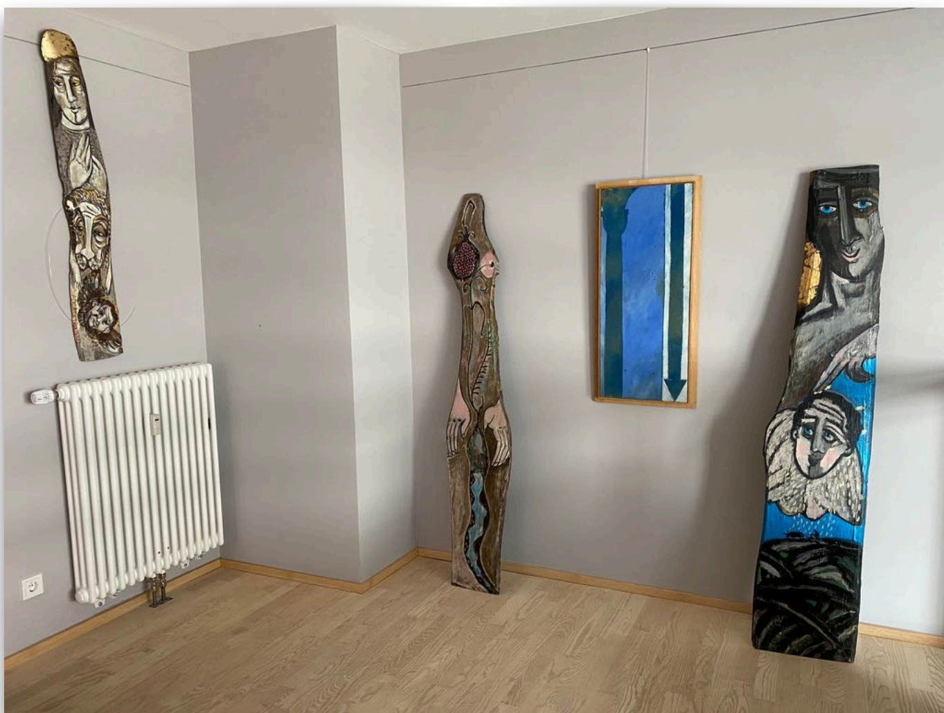
Exhibition of Ukrainian painters in the community of Cologne