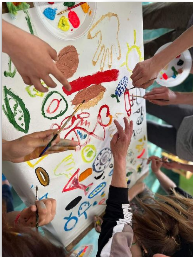
Painting with orphans in Lutsk