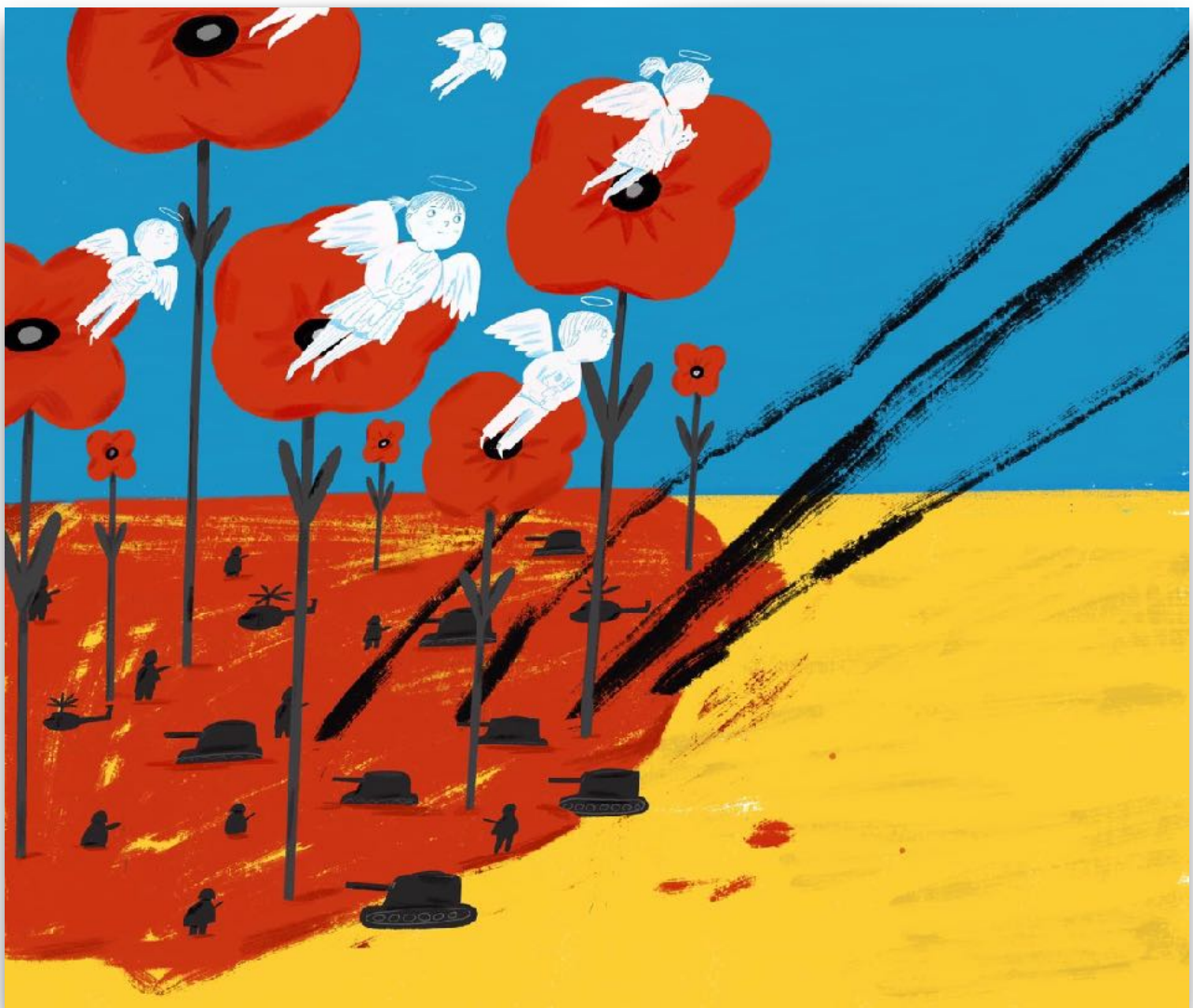
Flower Children from Oksana Drachkovska