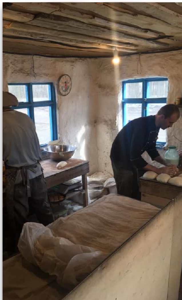
Reconstruction of the bakery in Bucha near Kyiv