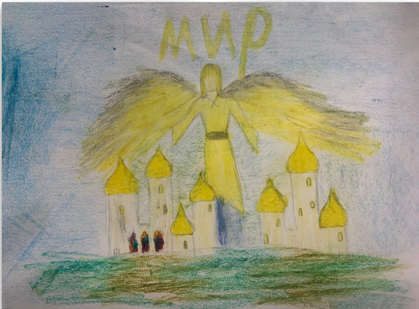
Children's picture from the Kyiv community

Donations to support refugees and humanitarian aid in connection with the war can please be transferred to the account of the West German Region of the Christian Community with a corresponding reference in the purpose of use: