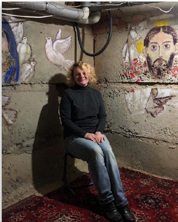
Painting bunkers in Lutsk