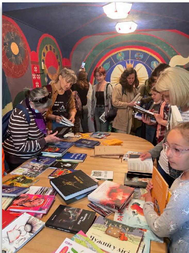
Distribution of children's books and painting in the community of Cologne