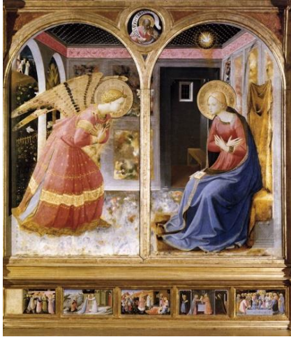
Fra Angelico: Annunciation