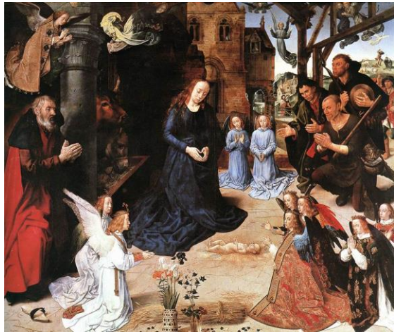
Van Der Goes: Adoration of the Shepherds

The Act of Consecration of Man; 8:00 AM: The Act of Consecration of Man; 11:00 AM: The Act of Consecration of Man; 12:15 PM: The Christmas Service for Children